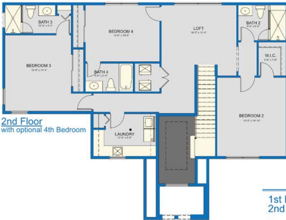
2nd Floor with optional 4th Bedroom